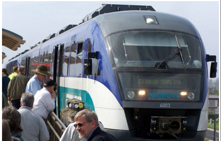
Sprinter train-set 4003 pauses for a Photo Op at the San Marcos State University station.