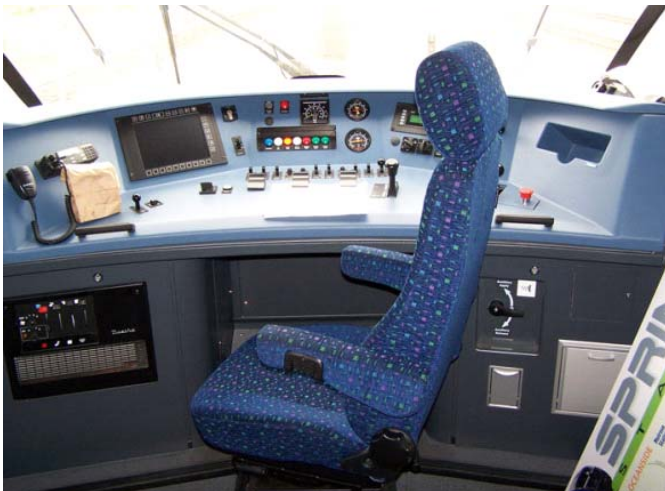
The new Sprinter's cab during the lunch break in Escondido. This break gave us lots of time to check out the new trains and station.