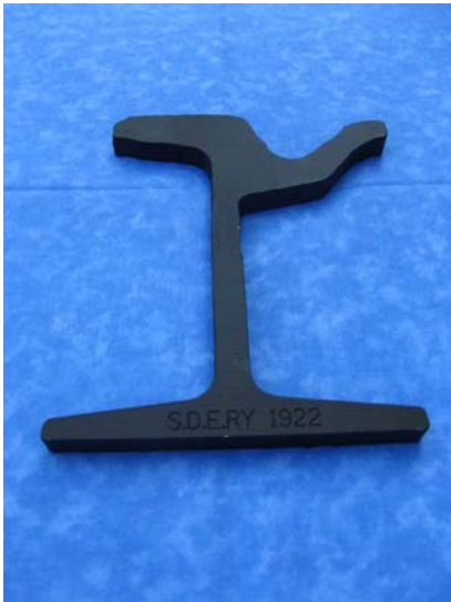
The unique profile of "girder rail" is shown in one of the slices available from the SDERA bookstore.

piece has been cleaned, painted, powder-coated, and is on display at the depot. Check it out next time you visit).