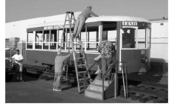
"Ernie" gets his roof patched by handy SDERA members