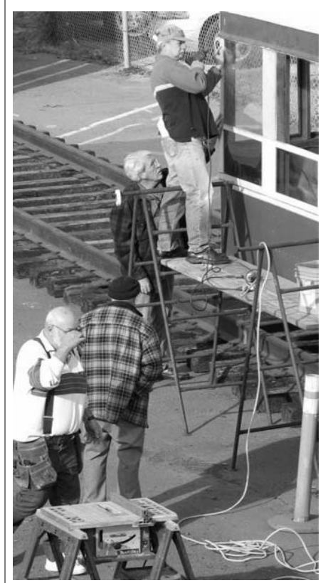
The first of the windows goes up to help temporarily protect the Birney Car

Thanks to the generosity of some friends of San Diego Electric Railway, our Birney car has some temporary windows—just in time for Winter.