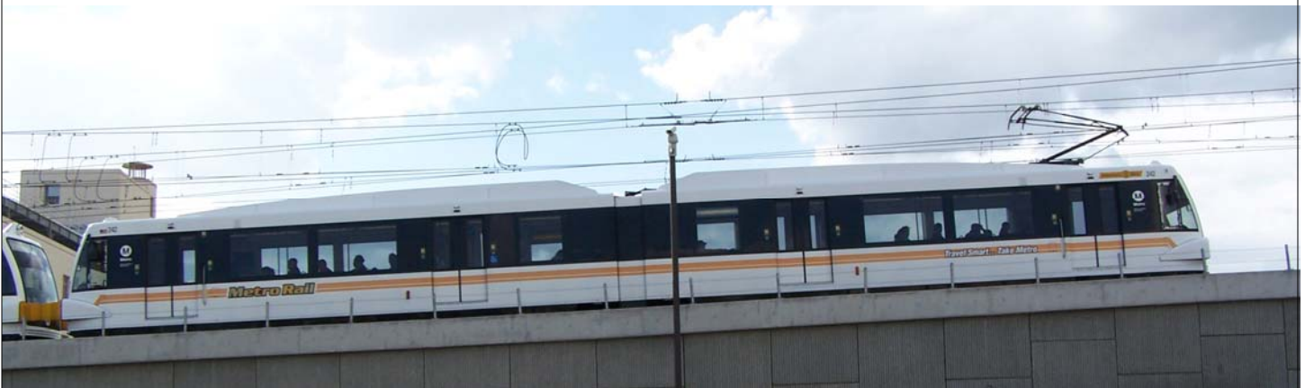
A Metro Rail Gold Line train departs Union Station bound for Pasadena.

Final plans are still being worked out and are subject to Metro Rail's work schedule. Revenue service is currently planned for November 14.