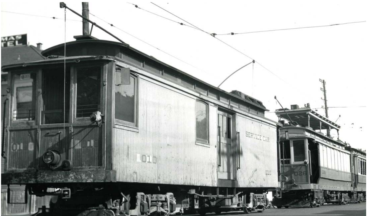
SDERy Service Car 010 at the Imperial Ave. Carhouse (Cars 026 and 023 in the background). - July 9, 1939