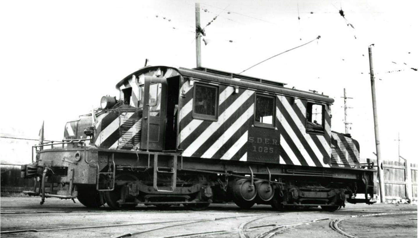
Freight Motor 1025 at the Adams Ave. Car Barn on July 9, 1939.