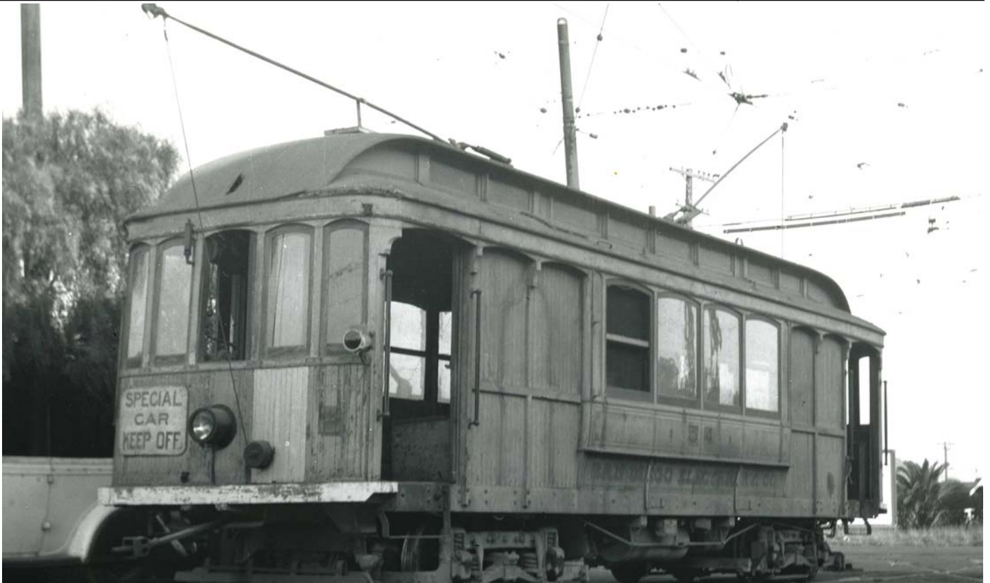
SDERy "Special Car" 54 at the Adams Ave. Car Barn - July 9, 1939