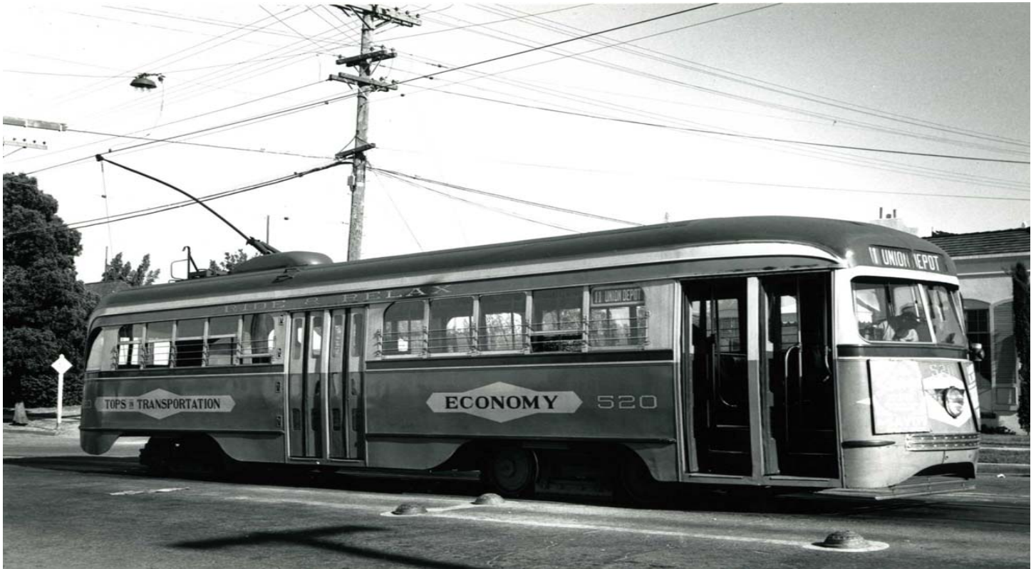
Car 520 at Edgeware Rd. and Adams Ave. in Kensington on the I I Line.