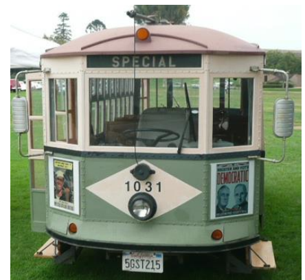
Herbie at the National City Car Show, 8/14/13

Finally moving day arrived and Art, the truck driver and a couple SDERA members worked to get Herbie loaded and tied down on a trailer and off for Tucson Herbie went!