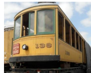
Class 1 Car 138 at storage location, 6/19/20