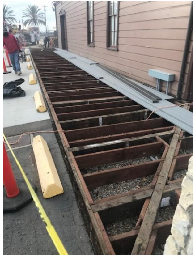
New support and deck in progress, 12/10/20