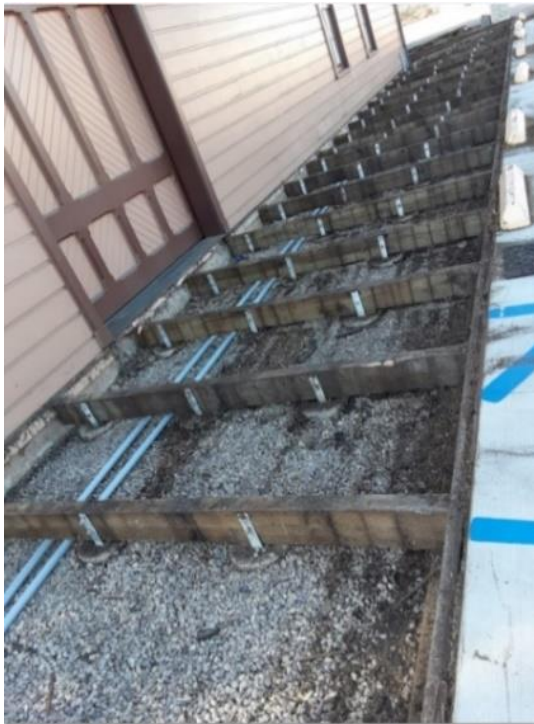
Front deck removed, 11/10/20

Whillock Contracting, Inc. of El Cajon, is replacing the decking around the perimeter of the Depot, to eliminate safety issues with the old decking. The project involves removing the wood deck, strengthening the framing and base, installing new Trex composite decking, and running electrical connections under the deck to the exterior of the Depot building. The project began in early November, with anticipated completion by the end of 2020. SDERA is responsible for the approximately $45,000 cost of the project which is only possible thanks to the generosity of our Members!