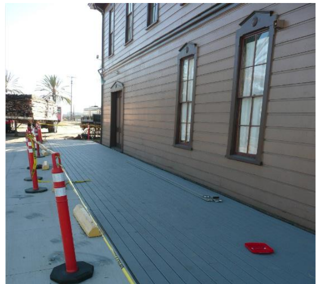
New decking, 12/21/20. Note wood from old deck on trailer at upper left